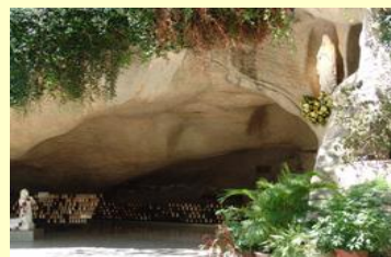
Oblate School of Theology Grotto