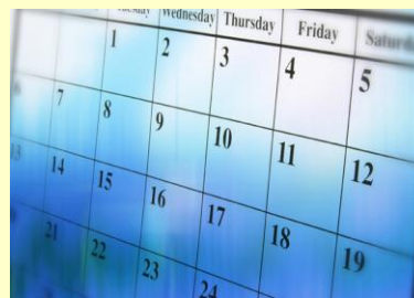
Save the date!

Due to increased demand, ACTS Leadership Workshops will be held bi-monthly beginning in February 2011. All workshops will be held at the Basilica Auditorium. Online registration is encouraged at www.rgvacts.org . The $20 fee for the full day event includes workshop materials, a light breakfast, and lunch. Registration may be paid online using Paypal or on site.