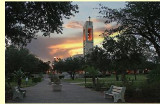
Our Lady of San Juan Basilica

Priests with established cores will meet from 10:00 AM to Noon.